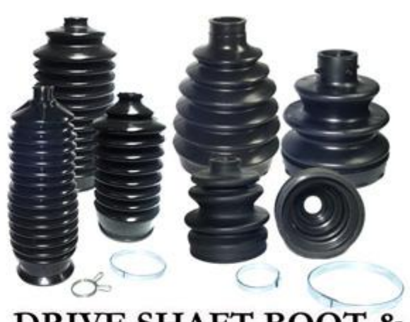
DRIVE SHAFT BOOT & STEERING BOOT