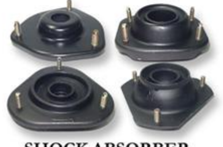
SHOCK ABSORBER MOUNTING